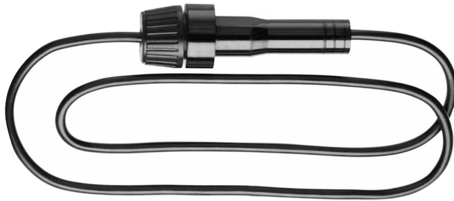
Dimensional Data: All dimensions (±0.015)