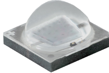
XT-E Royal Blue