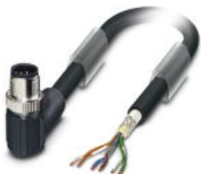
Bus system cable, VARAN, 6-position, PVC, black, shielded, cable length: 10 m, Customer version

Please be informed that the data shown in this PDF Document is generated from our Online Catalog. Please find the complete data in the user's documentation. Our General Terms of Use for Downloads are valid ( http://phoenixcontact.com/download )