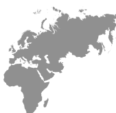
Europe Middle East Africa