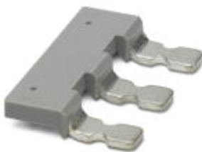
Insertion bridge, 3-pos., fully insulated

Please be informed that the data shown in this PDF Document is generated from our Online Catalog. Please find the complete data in the user's documentation. Our General Terms of Use for Downloads are valid ( http://phoenixcontact.com/download )