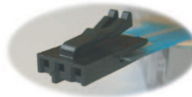
Crimflex Female Receptacles with a Latch Housing (RL)