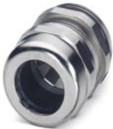
Cable gland, Cable gland material: Brass, nickel-plated, External cable diameter 3 mm ... 6.5 mm, Shielding: Yes, Connecting thread: M12, Color: silver

Please be informed that the data shown in this PDF Document is generated from our Online Catalog. Please find the complete data in the user's documentation. Our General Terms of Use for Downloads are valid ( http://phoenixcontact.com/download )