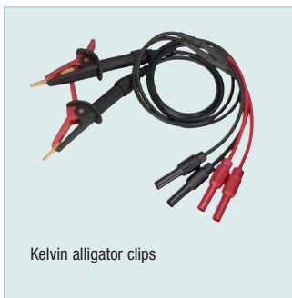
Kelvin alligator clips