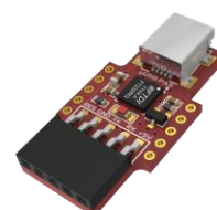
uUSB-PA5 Programming Adaptor