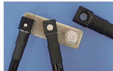
RAPID LOCK Bus Bar Connectors