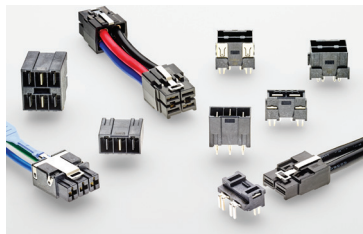
ELCON Mini Connectors