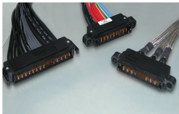
MULTI-BEAM XLE Cable Receptacles