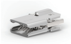
150A Bus Bar Connector