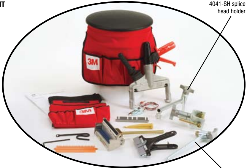
The 3M™ MS™ Splicing Rig 4049/NXG is a lightweight and portable splicing rig.