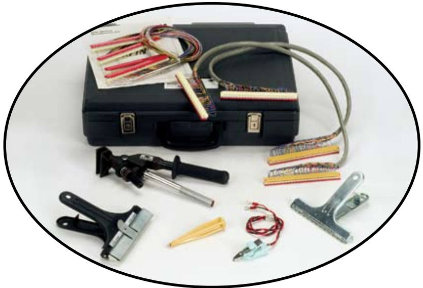
The 3M™ MS™ Module Maintenance Kit 4026-A contains the tools necessary for re-entry of super-mini and super-mate modules. The kit may be used for splice module combinations of two- through seven-way stackable splices.