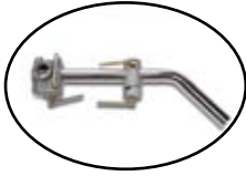
Universal Splicing Head Support Assembly 4045-SHSA

This assembly is designed to hold an MS 2 splicing head so it can be used in all applications.