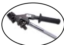
Hand Presser 4270-A

The only recommended tool to separate 4005-DPM/TR modules from any other module. Note: The 4053 cover removal tool cannot be used to separate DPM modules.