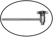
Variable Traverse Brace 4049-VTB

A module probe that permits one pair checking without damaging wire insulation. The prongs fit the test entry port of all MS 2 modules. The cord permits easy connection to a talk block or test set.