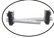
Split Support Tube 4046-CS

This assembly is designed to hold an MS 2 splicing head so it can be used in all applications.