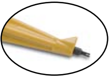
Wire Insertion and Cut-off Tool 4051

The 4049-VTB Variable Traverse Brace fits into the 4041-SH Splicing Head Holder and is designed to hold the MS 2 Splicing Head with Pedestal Support. It enables the user to position the MS 2 splice head where needed for greater splicing flexibility.