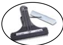
Separation Tool 4053-PM

Recommended for removing either bases or covers from 25-pair super-mini and covers only from 25-pair super-mate modules.