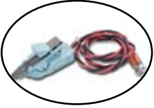
Pair Test Plug 4047

Collapsible for easy transport and setup.