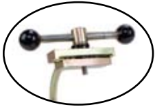
Aerial Strand Clamp 4035-A

Lightweight and hand-operated. When proper crimping pressure is reached, a bypass valve opens.