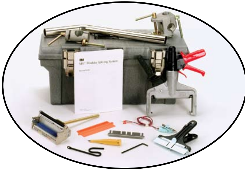
The 3M™ MS™ Universal Rig 4045-K/36/NXG is a versatile rig designed for one-person splicing in difficult-to-reach pedestal or rack areas.