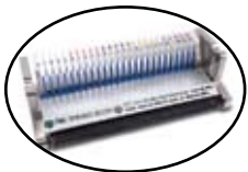
Splice Head 4041-SPL

The 4041-SH is the tool mounting assembly from the 4049-NXG and 4049-R Lite Rigs that holds the 4049-VTB Variable Traverse Brace. It enables the user to position the MS 2 splice head where needed for greater splicing flexibility.