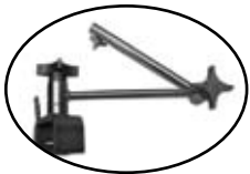
Splice Head Holder 4041-SH

Additional splicing head and "T" bar support for use with the MS 2 system.