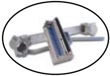
Splicing Head Assembly 4040

A self-contained, pistol-gripped crimper designed to crimp MS 2 modules in the 4041 splicing head.