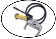
Hand/Hydraulic Crimping Unit 4031

Designed for high-volume module termination and uses air or nitrogen supply. An air cylinder or compressor with output pressure of 6.33–7.03 kg/cm (90–100 PSI) must be used. The unit is either hand- or foot-operated.