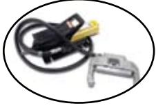
Air/Hydraulic Crimping Unit 4030

Durable, easy to transport tool box with tray. 66 x 29.2 x 28.2 cm (26 x 11.5 x 11.1") Cube: 9.8 kg. (21.7 lbs.) Ctn. size: 67.1 x 30 x 58.4 cm (26.4 x 11.8 x 23")