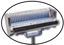
Splicing Head and "T" Bar 4041-P

This assembly contains a splicing head, a pedestal, a traverse clamp assembly with a long bar, and a head clamp for use with two-man fold-back splicing.