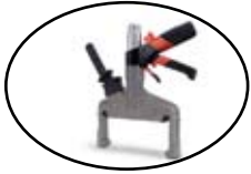
Hand Crimper 4036-25

Designed to hold a 4041-P splicing head in aerial splicing applications. Anchored to the suspension strand, the strand clamps behind and below the splice bundle and can be used with strands from 5 mm (3/16") diameter to 10 mm (3/8").