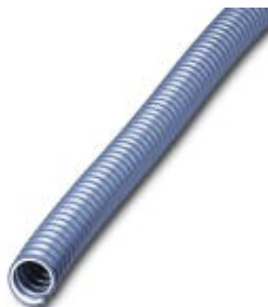
Protective hose, spring steel wire with PU coating, highly stranded

Please be informed that the data shown in this PDF Document is generated from our Online Catalog. Please find the complete data in the user's documentation. Our General Terms of Use for Downloads are valid ( http://phoenixcontact.com/download )