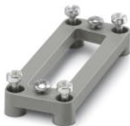
D-SUB adapter plate, for one D-SUB connector, no. of positions 25, housing series HC-D 15...

Please be informed that the data shown in this PDF Document is generated from our Online Catalog. Please find the complete data in the user's documentation. Our General Terms of Use for Downloads are valid ( http://phoenixcontact.com/download )