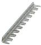
Fixed bridge, Number of positions: 10, Color: silver

Please be informed that the data shown in this PDF Document is generated from our Online Catalog. Please find the complete data in the user's documentation. Our General Terms of Use for Downloads are valid ( http://phoenixcontact.com/download )