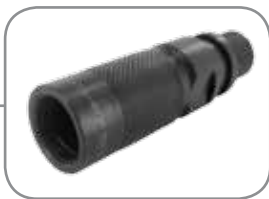
Plug with metallic band backshell

Part number: UCOM-10G+ P T x x B x: see the 'How to order' below to complete your part number