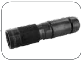
Plug with cable gland backshell

Part number: UCOM-10G+ P T x x G x x: see the 'How to order' below to complete your part number