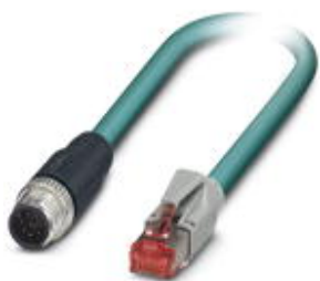
Assembled Ethernet cable, shielded, 4-pair, 26 AWG stranded (7-wire), RAL 5021 (water blue), M12 plug to RJ45 plug/IP20, line, length 0.3 m

Please be informed that the data shown in this PDF Document is generated from our Online Catalog. Please find the complete data in the user's documentation. Our General Terms of Use for Downloads are valid ( http://phoenixcontact.com/download )