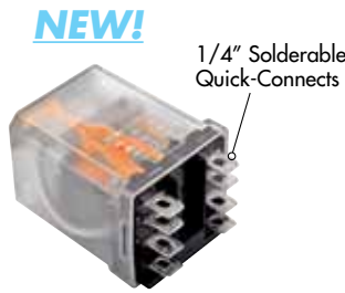
Plain Cover Option C