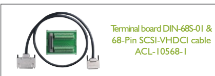
Terminal board DIN-68S-01 & 68-Pin SCSI-VHDCI cable ACL-10568-I