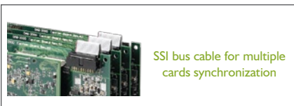
SSI bus cable for multiple cards synchronization

32-CH 16-Bit 500 kS/s Multi-Function DAQ Card with Encoder Input