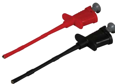
CT2489 (see model numbers above)

Copyright © 2007, Cal Test Electronics, Inc. All rights reserved. Information in this publication supersedes that in all previously published material. Trade names referenced are the service marks, trademarks or registered trademarks of their respective companies.