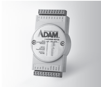
ADAM-4018+ FCC CE RoHS LISTED E190861 ETC.