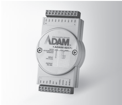
ADAM-4017+ FCC CE RoHS LISTED E190861 ETC.

8-ch Analog Input Module with Modbus 8-ch Thermocouple Input Module with Modbus 8-ch Universal Analog Input Module with Modbus