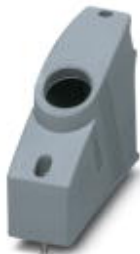
Sleeve housing, plastic, with metric cable outlet, locking screws with cylinder head, type: VC4, cable screw connection: M25

Please be informed that the data shown in this PDF Document is generated from our Online Catalog. Please find the complete data in the user's documentation. Our General Terms of Use for Downloads are valid ( http://phoenixcontact.com/download )