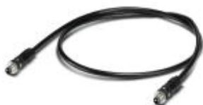
GOF MM cable, assembled with M12 OPTIC to M12 OPTIC

Assembled FO cable, round cable, 50/125 µm GOF-MM fiber, M12 to M12, for installation inside buildings