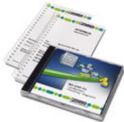
Network configuration software for INTERBUS Generation 4

Please be informed that the data shown in this PDF Document is generated from our Online Catalog. Please find the complete data in the user's documentation. Our General Terms of Use for Downloads are valid ( http://phoenixcontact.com/download )