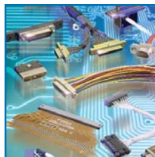
Microdot Connectors and Cables