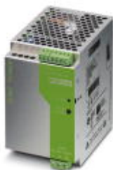
DIN rail power supply unit, primary-switched mode, 1-phase, output: 48 V DC / 5 A

Please be informed that the data shown in this PDF Document is generated from our Online Catalog. Please find the complete data in the user's documentation. Our General Terms of Use for Downloads are valid ( http://phoenixcontact.com/download )