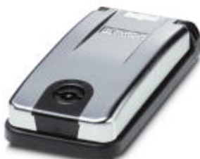
Mounting frame for one front plate/socket, frame: black, cover: metallic, closed with 3 mm two-way key bit.

Please be informed that the data shown in this PDF Document is generated from our Online Catalog. Please find the complete data in the user's documentation. Our General Terms of Use for Downloads are valid ( http://phoenixcontact.com/download )