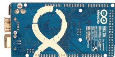
Arduino ADK Back