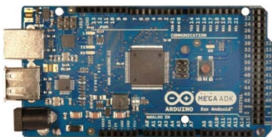
Arduino ADK Front