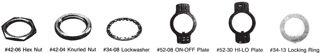
#42-06 Hex Nut #42-04 Knurled Nut #34-08 Lockwasher #52-08 ON-OFF Plate #52-30 HI-LO Plate #34-13 Locking Ring