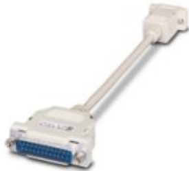
Adapter cable, 9-pos. D-SUB socket to 25-pos. D-SUB male

Please be informed that the data shown in this PDF Document is generated from our Online Catalog. Please find the complete data in the user's documentation. Our General Terms of Use for Downloads are valid ( http://phoenixcontact.com/download )