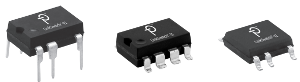
DIP-8C (P Package)