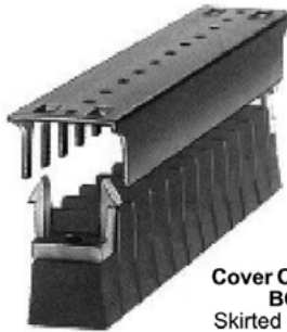
Cover Options BO Skirted access on one side only.