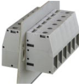
The illustration shows version HDFK 50 in gray

Please be informed that the data shown in this PDF Document is generated from our Online Catalog. Please find the complete data in the user's documentation. Our General Terms of Use for Downloads are valid ( http://download.phoenixcontact.com )