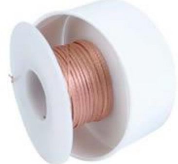
1802-500F Pro Wick Yellow #2 Braid 500' 1 units/case