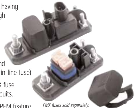
FMX fuses sold separately.

Electrical terminations not supplied by Cooper Bussmann.