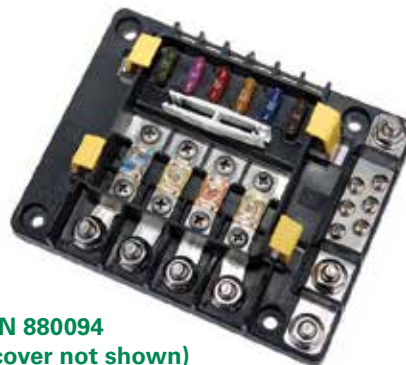
PN 880094 (cover not shown)