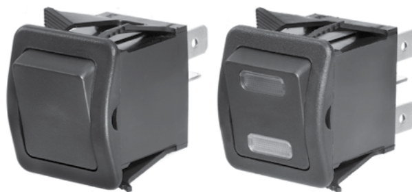
K2 Series Single & Double Pole