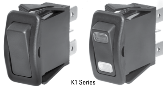
K1 Series Single Pole