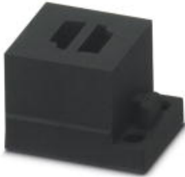
Small, slotted cable sleeves suitable for two AS-i cables, material: NBR, version: left, left

Please be informed that the data shown in this PDF Document is generated from our Online Catalog. Please find the complete data in the user's documentation. Our General Terms of Use for Downloads are valid ( http://phoenixcontact.com/download )