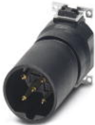
Flush-type connector, 5-position, PlugLink:straightLink:M12, B - inverse, PCB mounting, SMD

Please be informed that the data shown in this PDF Document is generated from our Online Catalog. Please find the complete data in the user's documentation. Our General Terms of Use for Downloads are valid ( http://phoenixcontact.com/download )