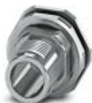
Housing screw connection, PlugLink:M12-SPEEDCON, Rear mounting, M15 x 1

Housing screw connection - SACC-BP-M-M12/M15-6-SMD SCO - 1414002