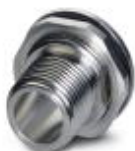
Housing screw connection, PlugLink:M12, Rear mounting, M15 x 1

Housing screw connection - SACC-BP-M-M12/M15-6-SMD - 1414000