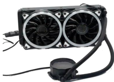
Pump Plate Dimensions