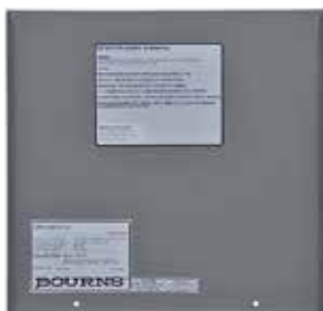
Inside Front Panel