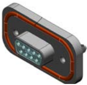
9 POSITION CONNECTOR SHOWN