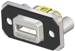
MUSB-K152-30 SERIES MICRO-AB RIGHT ANGLE, PCB TAIL