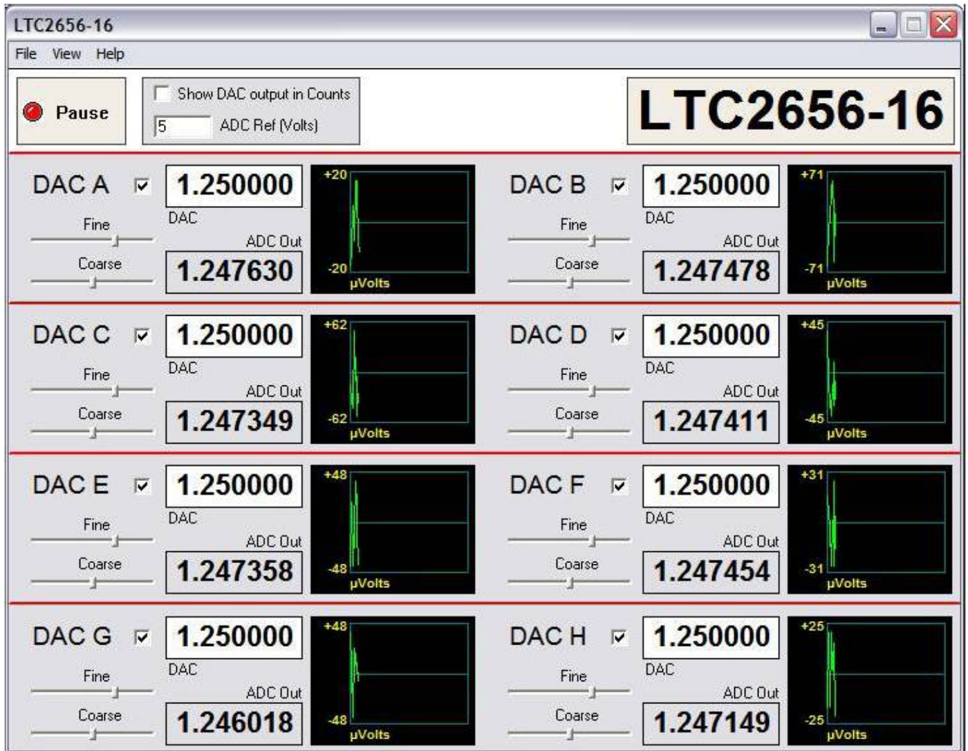
Figure 2. Demo Board Software

Complete software documentation is available from the Help menu item, as features may be added periodically.