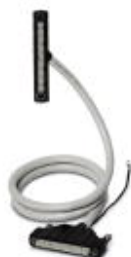
Assembled round cable with two molded 40-pos. socket strips (1:1 connection). Cable length: 18.0 m

Please be informed that the data shown in this PDF Document is generated from our Online Catalog. Please find the complete data in the user's documentation. Our General Terms of Use for Downloads are valid ( http://phoenixcontact.com/download )