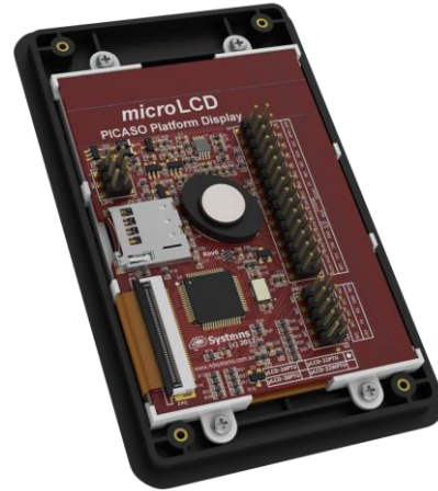
uLCD-32PTU Mounted in 3.2" Bezel - Back