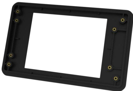
Bare 3.2" Bezel - Back