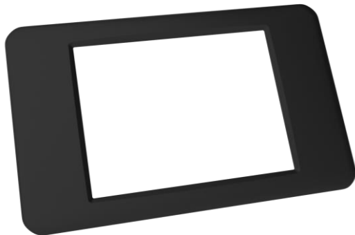
Bare 3.2" Bezel - Front