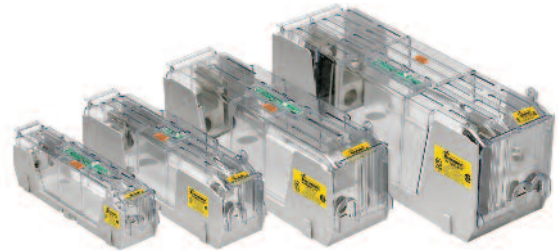
600V Class H(K) and R