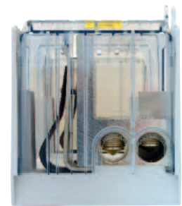
All 600A Versions