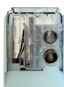
Optional 400A Class J Version (JM60400- MW22)

††For Class J 400A double box lug configuration, optional cover provides IP20 finger-safe protection for dual 350kcmil-1 AWG wires or one single 350kcmil-6 AWG wire.