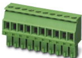
The figure shows a 10-pos. version of the product in green

PCB connector, nominal current: 8 A, number of positions: 2, pitch: 3.81 mm, connection method: Screw connection with tension sleeve, color: light gray, contact surface: Tin