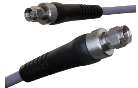
DKT Cable Assembly SMA Male Straight to SMA Male Straight HP190S Cable